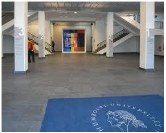
Conference venue 'Seminargebäude am Hegelplatz' (outside and Foyer)